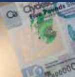
1. Clear window