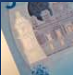
1. Clear window