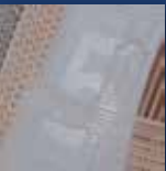
3. Embossed numeral