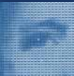
2. Raised print