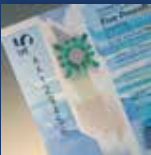
1. Clear window