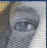
2. Raised print