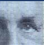
2. Raised print