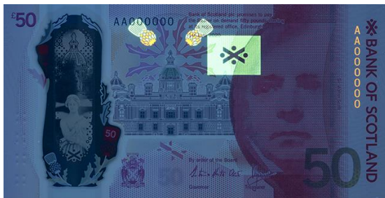
Bank of Scotland (Front)