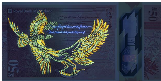
Royal Bank of Scotland (Rear)