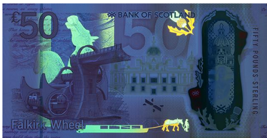
Bank of Scotland (Rear)