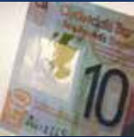
1. Clear window