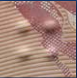
3. Tactile emboss