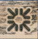
2. Raised print