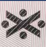
2. Raised print