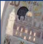
1. Clear window