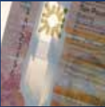
1. Clear window