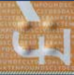
3. Tactile emboss